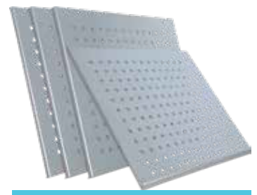
OPTIONAL CHROME SHELVES