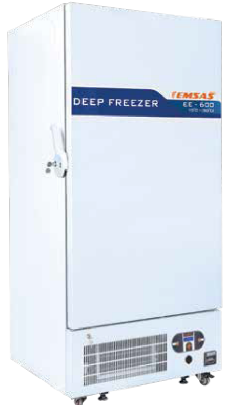
EE 600 (-5°C/-30°C)