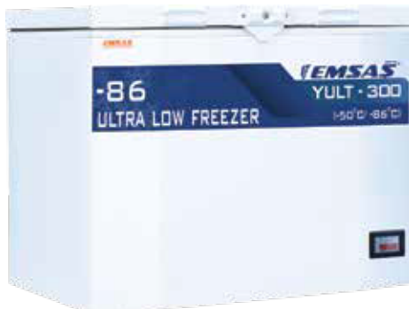
YULT 300 (-50°C / -86°C)