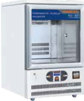
ECI 01 (+22 °C/+24 °C)