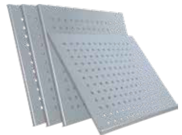
OPTIONAL CHROME SHELVES