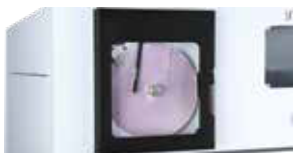
OPTIONAL GRAPHICAL CHART RECORDER