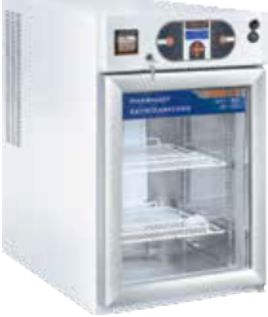
EKT 80 (0 °C/+15 °C)