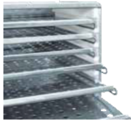
EAJ 09 54 PCS