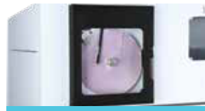
OPTIONAL GRAPHICAL CHART RECORDER