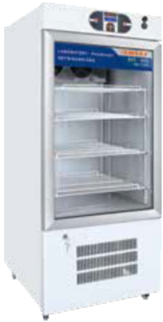
EKT 250 (0 °C/+15 °C)