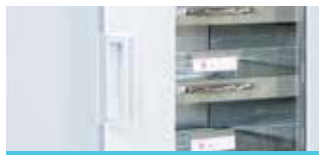
OPTIONAL BLOCK 3XGLASS DOOR