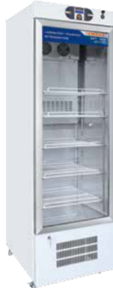
EKT 425 (0 °C/+15 °C)