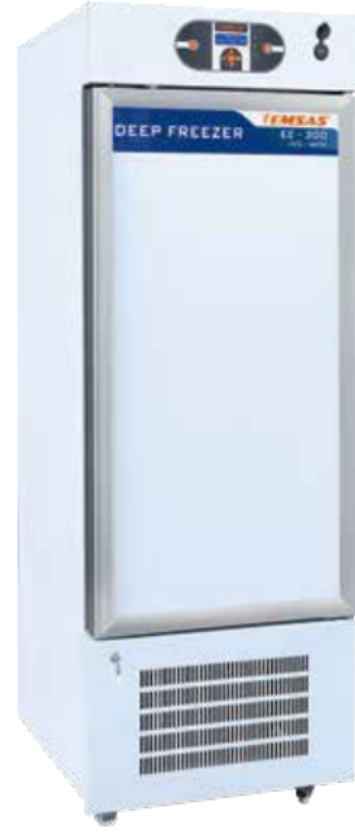
EE 300 (-5°C/-30°C)