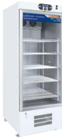
EKT 725 (0 °C/+15 °C)