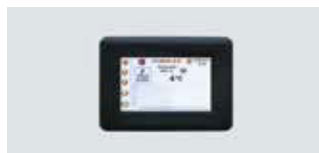
STANDARD TOUCH SCREEN DISPLAY