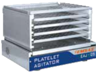
EAJ -L 05 30 PCS