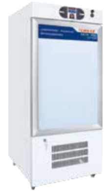
OPTIONAL BLOCK DOOR