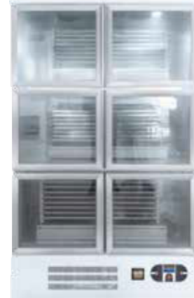
ECI 03 (+22 °C/+24 °C)