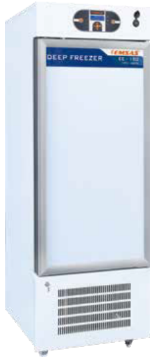
EE 150 (-5°C/-30°C)