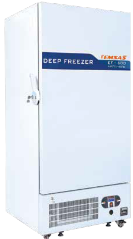
EF 600 (-20°C/-40°C)