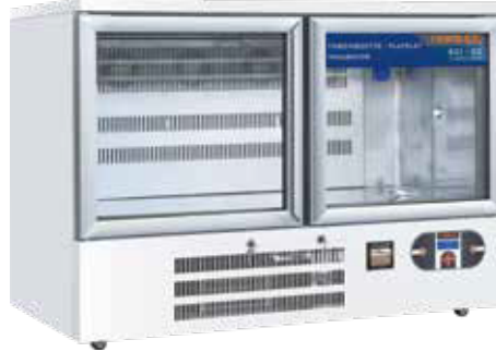
ECI 02 (+22 °C/+24 °C)