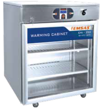
EMI 250 (Chrome) (Rt+5°C/+80°C)