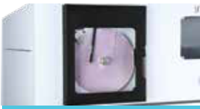
OPTIONAL GRAPHICAL CHART RECORDER