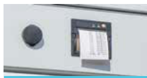
OPTIONAL THERMAL PRINTER