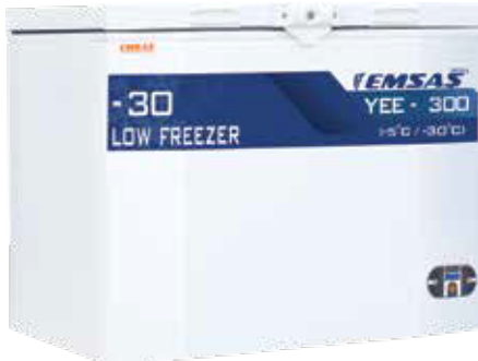
YEE 300 (-5°C/-30°C)