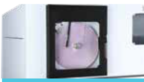
OPTIONAL GRAPHICAL CHART RECORDER