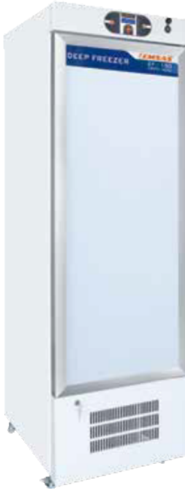
EF 150 (-20°C/-40°C)