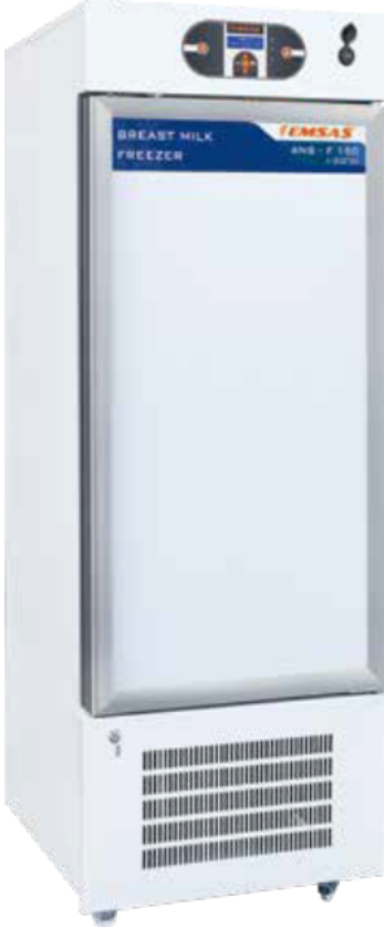
ANS-F 150 (-20°C)