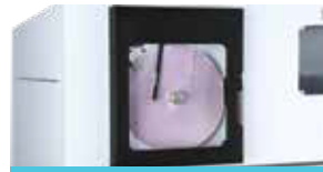
OPTIONAL GRAPHICAL CHART RECORDER