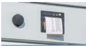
OPTIONAL THERMAL PRINTER