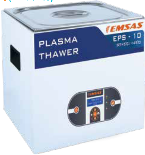
EPS 10 (RT+5 / +45)