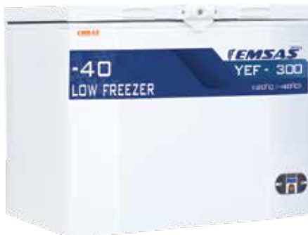
YEF 300 (-20°C/-40°C)