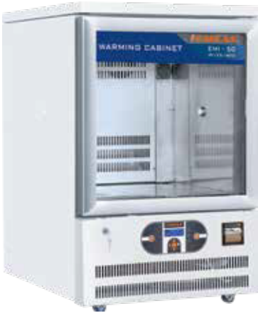
EMI 50 (Rt+5°C/+80°C)