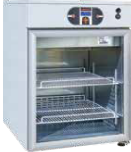
EKT 150 (0 °C/+15 °C)