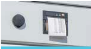
OPTIONAL THERMAL PRINTER