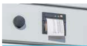
OPTIONAL THERMAL PRINTER