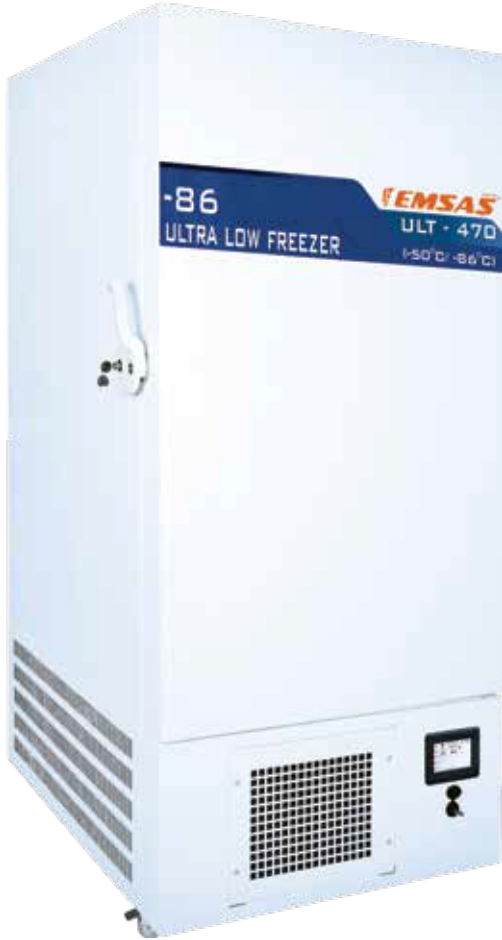
ULT 470 (-50°C / -86°C)