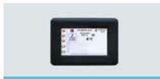
OPTIONAL TOUCH SCREEN DISPLAY