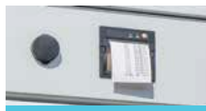
OPTIONAL THERMAL PRINTER