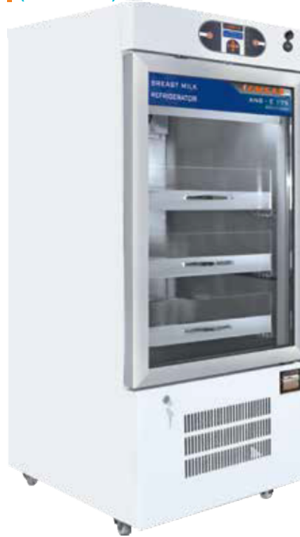
ANS-E 175 (0 °C/+15 °C)