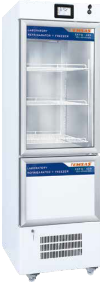
EKT-D 425 (0 °C/+15 °C) (-5 °C/-30 °C)