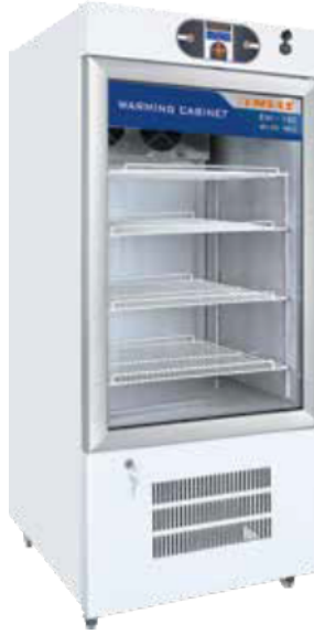
EMI 150 (Rt+5°C/+80°C)