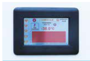
OPTIONAL TOUCH SCREEN DISPLAY