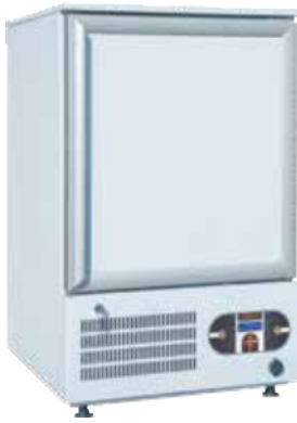
EF 100 (-20°C/-40°C)