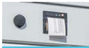
OPTIONAL THERMAL PRINTER