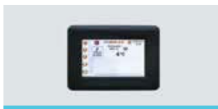
OPTIONAL TOUCH SCREEN DISPLAY