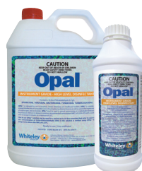
Pack Size: 5L, 1L