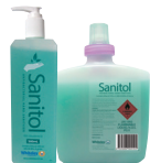
Pack Size: 500mL, 1L

Bactol® Moisturiser has been designed to protect the skin. It is enriched with Vitamin E, pH balanced and lanolin free. It absorbs quickly and is suitable for use under gloves. The perfect complement to Bactol® alcohol based hand rub.