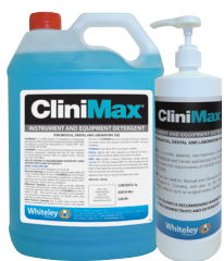
Pack Size: 5L, 1L

The instruments used in dentistry are often very delicate, expensive and the chemicals used to clean instruments need to be specially formulated to effectively clean and disinfect without harming the instruments or users. Whiteley Corporation has developed a range of instrument detergents and disinfectants specifically for use in Dentistry.