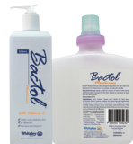
Pack Size: 500mL, 1L