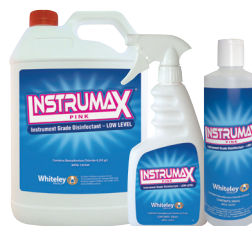
Pack Size: 5L, 500mL