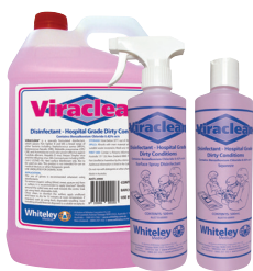
Pack Size: 5L, 500mL Trigger, 500mL Squeeze