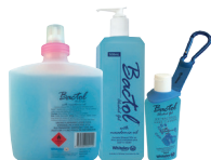
Pack Size: 80mL, carabiner, 500mL, 1L pod