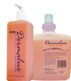
Pack Size: 500mL, 1L Pod