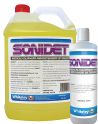
Pack Size: 5L, empty 500mL bottle