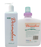
Pack Size: 500mL, 1L Pod