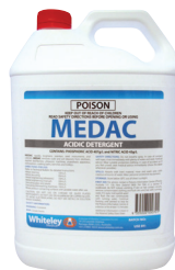
Pack Size: 5L