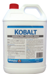
Pack Size: 5L