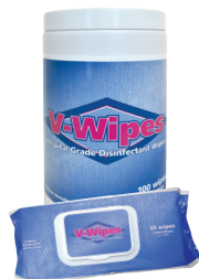
Pack Size: 100 Wipes (Canister), 50 Wipes (Flatpack)