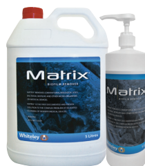
Pack Size: 5L, 1L