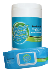
Pack Size: 100 Wipes (Canister), 50 Wipes (Flatpack)